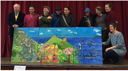
Launch of Roaming mural at St. Ives Farmers' Market