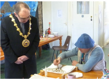
Open Days at Roaming

Roaming began as the Breadline Art Group, a few people associated in various ways with St. Petroc's Society ("supporting single homeless people in Cornwall"). They just liked to paint and draw and talk together. They liked it so much, in fact, that in 2013 one of them registered Roaming as an independent Community Interest Company (CIC). The group has changed size and shape, but still meets Thursdays, 9:30 – 3:30 at the Breadline Café in Penzance, a space still maintained by St Petroc's. Then, as now, decisions are made in group conversations.