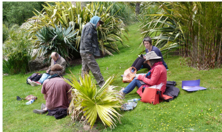
Drawing at Tremeneere