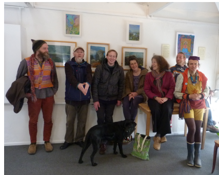
Exhibition at Red Wing Gallery